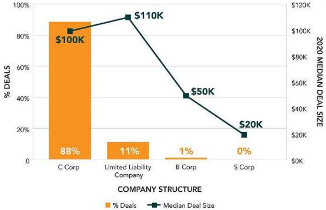
Figure 16 – C Corp Dominate Company Structures